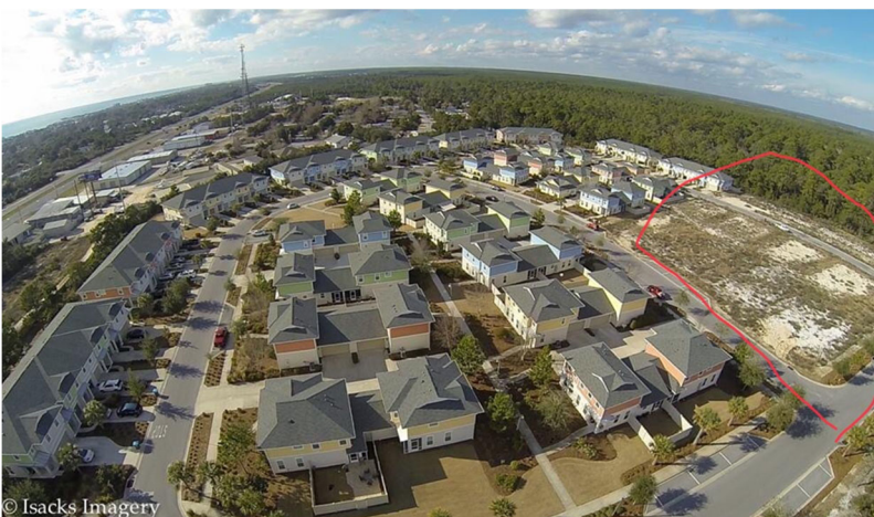
The DR Horton Townhome neighborhood is indicated in the red circle.

It's been an incredible journey and we are fortunate to live in the most beautiful family community on the Beach!