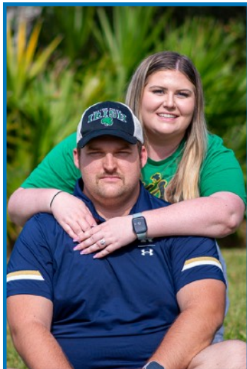
Sample Simple Portrait

Bring your chair and favorite beverage and come out for a great day of socializing with your neighbors, enjoy some great food and help a great cause.